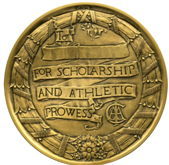
Shows teams: Illinois, Indiana, Iowa, Maryland, Michigan, Michigan State, Minnesota, Nebraska, Northwestern, Ohio State, Penn State, Purdue, Rutgers, Wisconsin