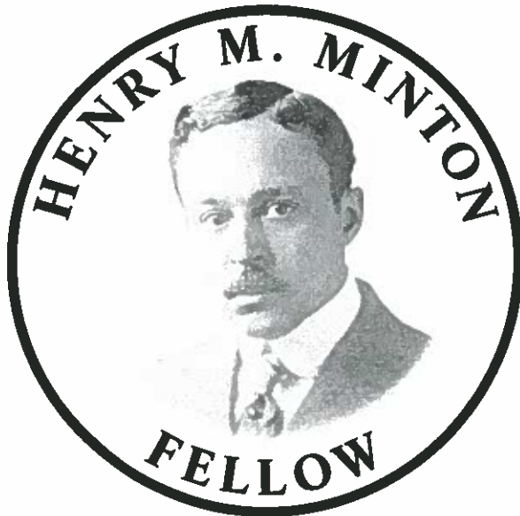
Obverse medal illustration

NOTE: Center image will be sculpted and will look 3-D