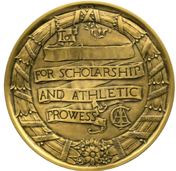
Shows teams: Illinois, Indiana, Iowa, Michigan, Michigan State, Minnesota, Northwestern, Ohio State, Penn State, Purdue, Wisconsin