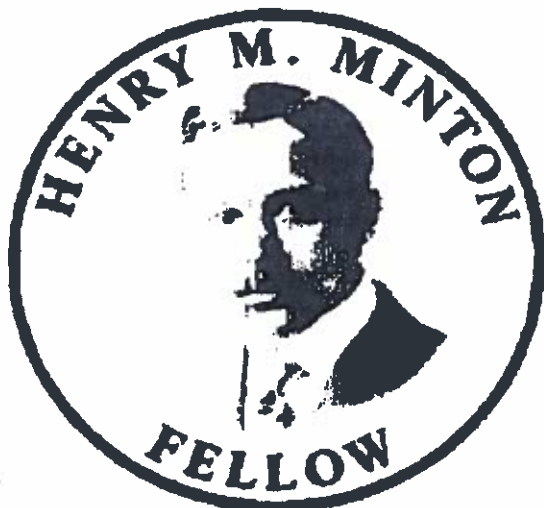
Obverse medal illustration

NOTE: Center image will be sculpted and will look 3-D