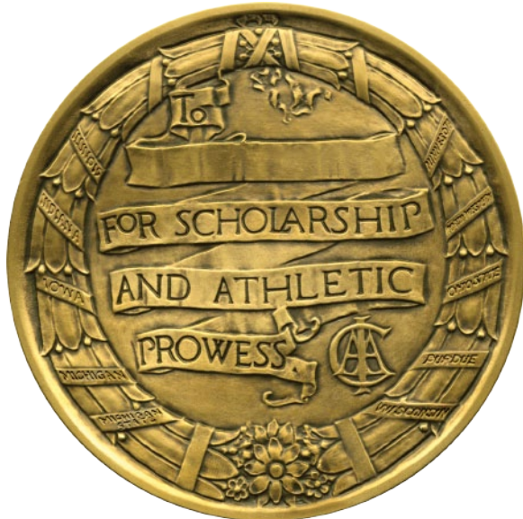
Shows teams: Illinois, Indiana, Iowa, Michigan, Michigan State, Minnesota, Northwestern, Ohio State, Purdue, Wisconsin