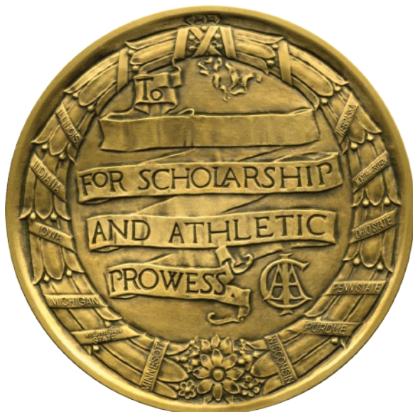
Shows teams: Illinois, Indiana, Iowa, Michigan, Michigan State, Minnesota, Nebraska, Northwestern, Ohio State, Penn State, Purdue, Wisconsin