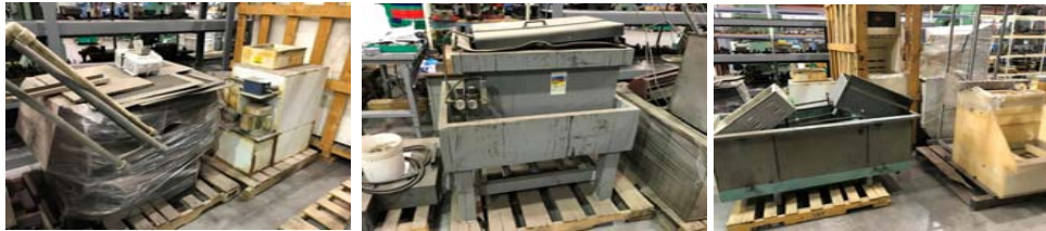
1 Pallet of Misc Control Boxes and Electrical Hookup Cases