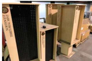
LOT OF RETAIL MERCHANDISE FURNITURE