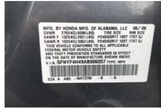
2006 HONDA PILOT