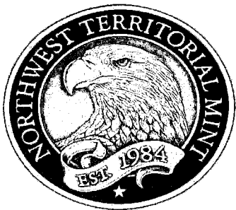
EXHIBIT B NORTHWEST TERRITORIAL MINT LLC