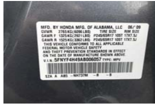
2006 HONDA PILOT