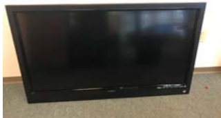
40 INCH VISIO TV FROM LIBRARY