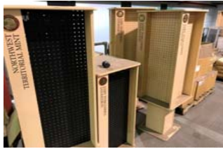
LOT OF RETAIL MERCHANDISE FURNITURE