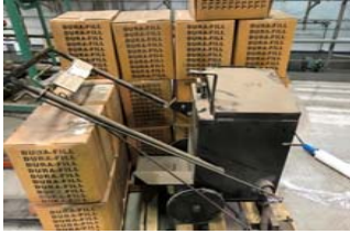
TAR Crack Sealer and Boxes of Tar