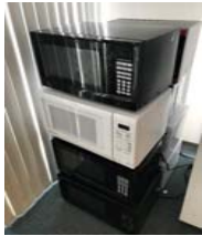
LOT OF MICROWAVES