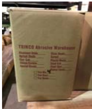
Trinco Mix (Sandblast)