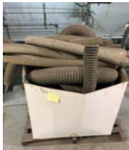
1 Pallet of Vacumm Hoses