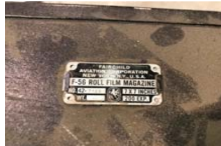
WWII CAMERA F-56 ROLL MAGAZINE