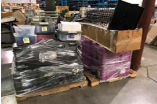
2 PALLETS OF TRADE SHOW EQUIPMENT