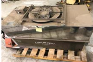
Air King Fileter System