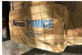
Quarter Pallet of Pumice (Sandblast)