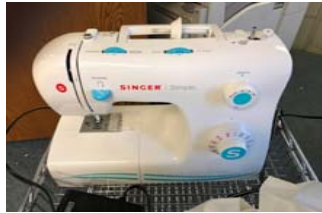
2 SINGER Sowing Machines