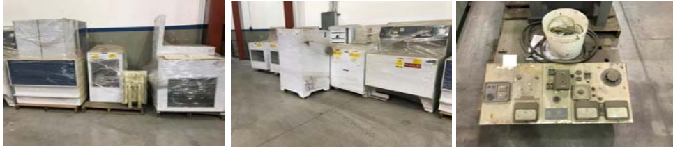
Pallets of Misc Plating Tubes and Control Boxes