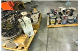
3 Pallets Misc Wire