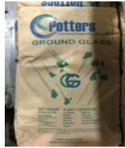
Pallet of Potters (Sandblast)