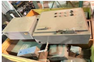
1 Pallet of Misc Control Boxes and Electrical Hookup Cases