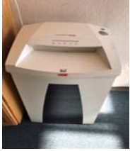
LOT OF SHREDDERS